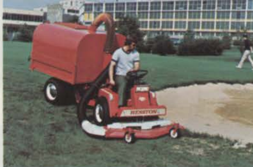
Turf Truck's 50-bushel collection box offers greater capacity for the self-contained Vacuum Pickup attachment.