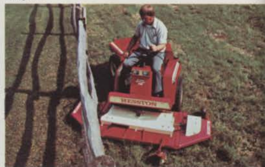
Giant 80" batwing mower reaches under fences and shrubs, and over creek beds. Batwings retract to 48" width.