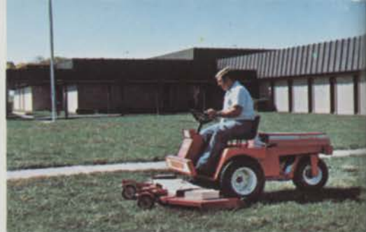
Three Wheeler offers up-front visibility, away from heat and fumes. A traditional Front Runner convenience.