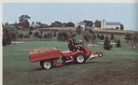
Capacity plus stability. Turf Truck's 3/4 cu. yd. bed hauls a full load up steep inclines with power to spare!