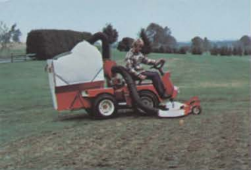
GMT vacuums as you mow. Self-contained Vacuum Pickup attachment features a 20-bushel collection box. No trailer needed.