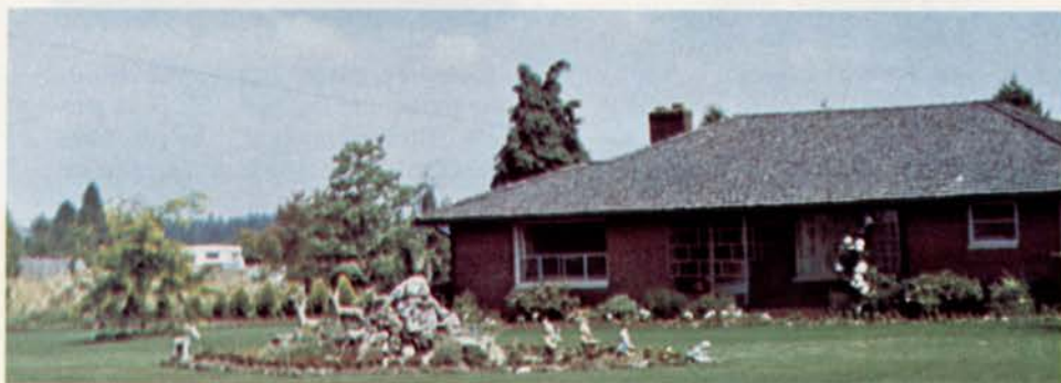
Home lawn near Woodburn, Oregon after three years in 100% Manhattan.