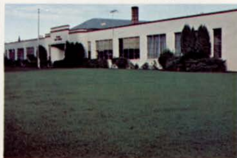
School grounds in St. Paul, Oregon gets plenty of traffic but still looks great.