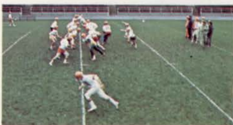
Sprague football stadium, Salem, Oregon holds up well even in the soaking rains of Oregon's fall months.