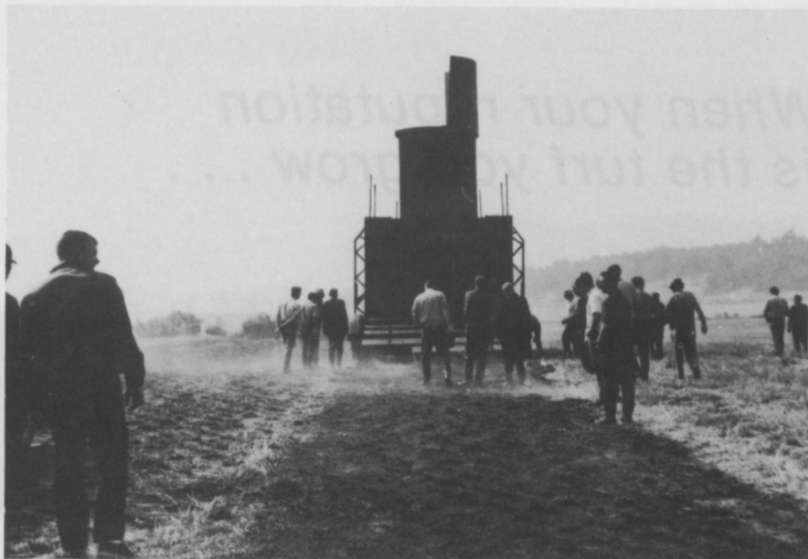
Mechanical sanitizer, one alternative to open field burning, shown in operation. Several kinks must be worked out before it becomes a practical replacement.

Of 280,183 acres approved for burning, only 186,260 were burned in 1975, the lowest number since 1968. This is 82 percent of the South Valley and 76 percent of the North Valley, due to rain, wind direction