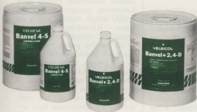
Circle 124 on free information card