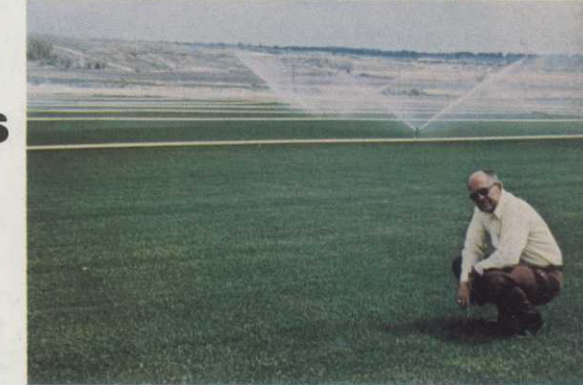
"In our climate of cool nights, warm days, high winds and low humidity, we need a grass that can survive long hauls, and stay green, fresh and beautiful."

"We've been growing Baron both in our mixtures and pure stands. We're impressed with Baron's rapid establishment, rugged durability and beautiful final appearance on customers' lawns. And Baron holds its color-even with neglect."