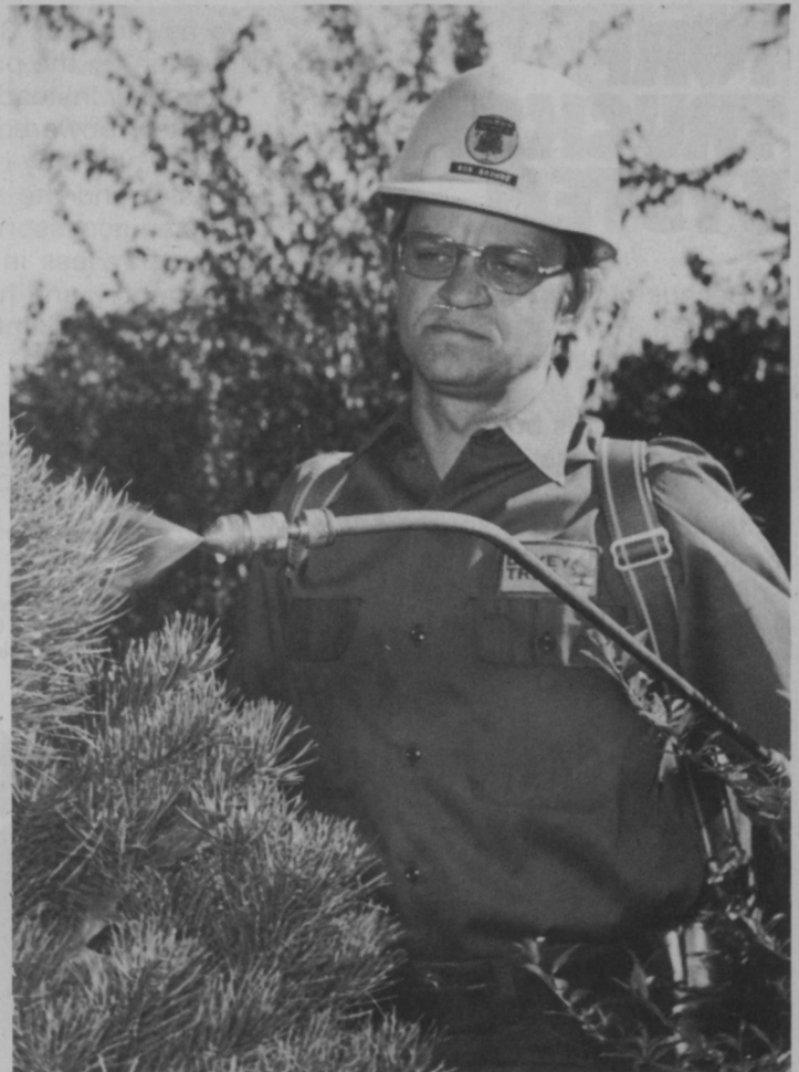
Wilt-Pruf NCF provides an organic film that reduces transpiration in recent transplants and also serves as a protectant for established plants against drying winter winds. The foliage should be sprayed until thoroughly wetted to the point of run-off.