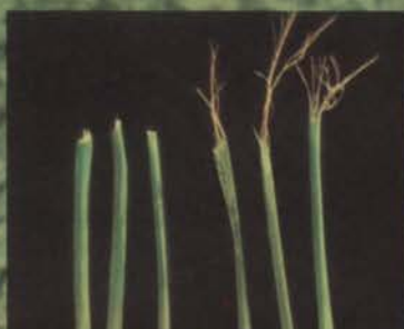
Clean-cutting Pennfine Conventional Ryegrass