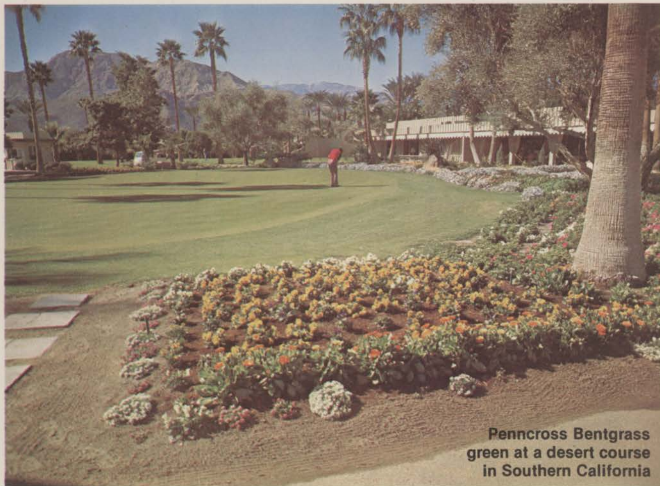
Penncross Bentgrass green at a desert course in Southern California