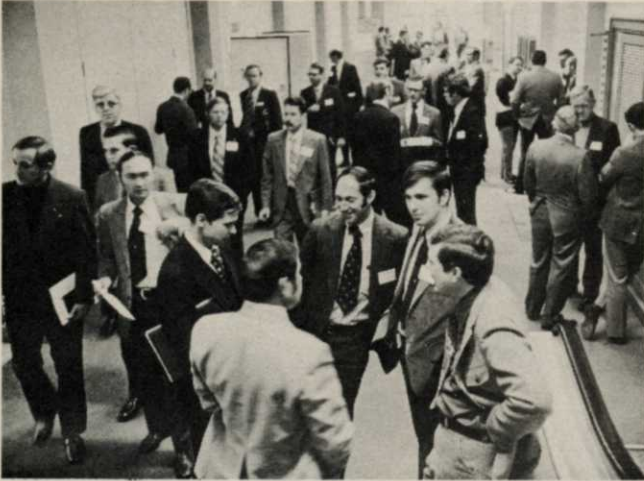
More than 1000 weed scientists listened to over a 150 papers during this year's meeting. Here, friends gather in informal discussion while others hurry to hear another paper.