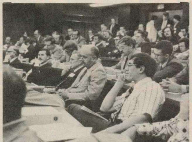
There was standing room only in this section on control of Weeds and woody plants on utility, railroad and highway rights-of-way and industrial sites. Papers were presented on three experimental compounds, Spike tebuthiuron, Krenite brush control agent, and Roundup glyphosate.