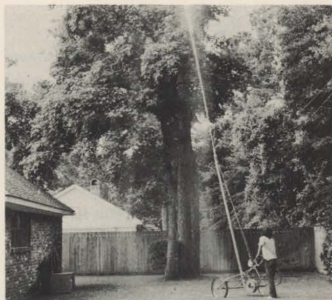
PORTABLE SPRAY BOOM: Agricultural Chemical Service, Bellaire, Tx.

A wireless tachometer ideal for use with one cylinder 2 and 4 cycle engines. Engines revolutions are measured without stopping the engine or making any connections. The tach is merely held near the spark plug to take a reading. A built-in antenna receives radiated pulses which are converted into R.P.M. readings. The instrument is equipped within \pm 2 percent of full scale. For more details, circle (707) on the reply card.