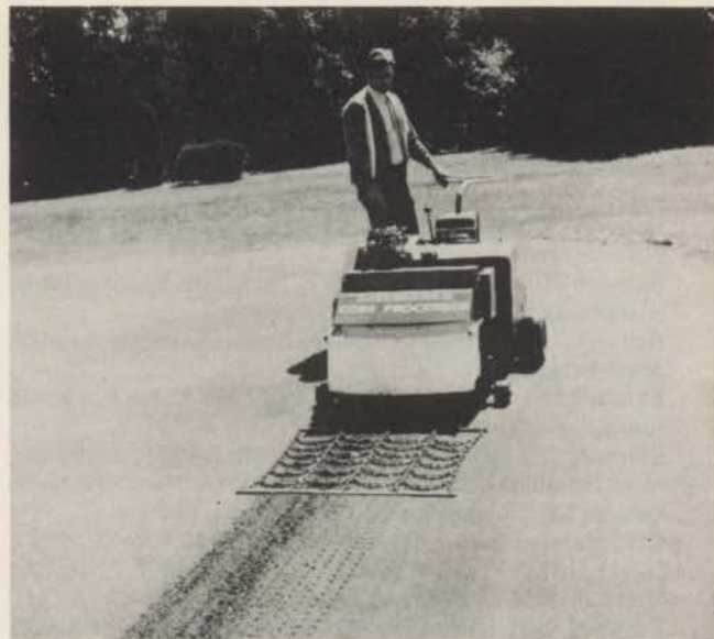
CORE PROCESSOR: Ryan Turf Equipment, Lincoln, Neb.

This heavy duty all steel remote enclosure for automatic irrigation control incorporates beauty and superintendents' convenience. The unit is all weather resistant and vandal proof. It features: two-way communication systems, fluorescent lighting — for ease of night time programming, 120V supplemental power source, low wattage heat light for dampness and condensation control and terminal strips for controller — zone valve — master satellite wiring, etc. For more details, circle (705) on the reply card.