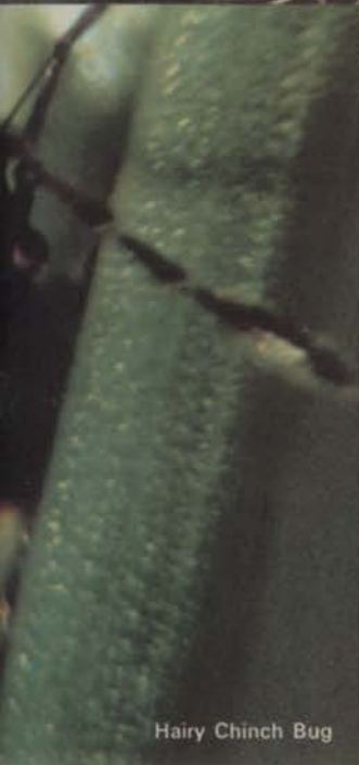
Hairy Chinch Bug