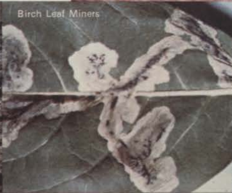
Birch Leaf Miners