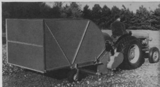
The GROUND'S GROOMER picks up thatch, clippings and debris in a 5-foot path.

Blade cutting ranges are from 2" into the ground for vertical slicing - to 3" above ground for rough mowing. All blades are "free-swinging" and rotate in reverse. This design creates air turbulence which blows leaves, thatch, clippings, etc., into the hopper.