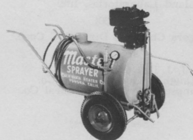
BELT GUARD NOT ILLUSTRATED