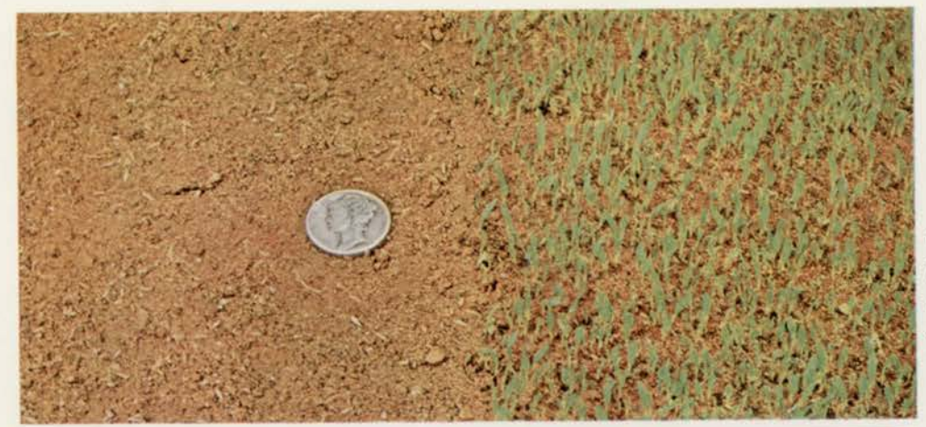
This entire area was seeded with bluegrass and crabgrass. Left-hand side was sprayed with "Tupersan" the same day it was seeded. Note absence of crabgrass in treated area seven days after treating.