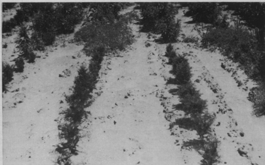
A dormant application of granular simazine controls weeds for several months, author Ahrens says.

quarters, and chickweed. Like simazine, DCPA can be sprayed directly over plants or applied in granular form. One of the promising treatments of the future for ornamental plantings may well include a combination of DCPA with simazine or some other broad-spectrum weed killer. Applicators may obtain DCPA under trade name of "Dacthal," as wettable powder or in granules.