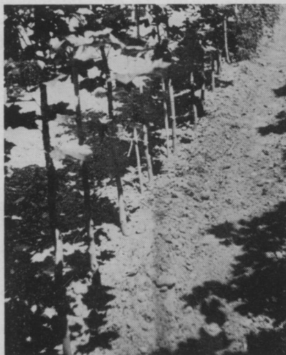
In deciduous plantings, such as these maples, a directed application of amitrole plus simazine kills established weeds and prevents further weed infestation for very long periods.

Since no single herbicide controls all weeds in all ornamental crops it is inevitable that herbicide combinations will be used to a greater extent in the future. Since simazine has long residual activity against broad-leaved weeds at low rates of application, it could be combined with herbi-