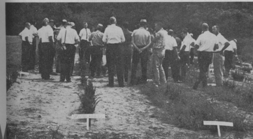
A permanent nursery where herbicides may be tested for effectiveness in ornamental plantings is a feature of the Connecticut Agricultural Experiment Station. Photo was made about 9 weeks after 6th annual application.

Neburon (1-n-butyl-3-(3,4-dichlorophenyl)-1 methyl urea, available under trade name "Kloben" as wettable powder), can be safely applied on most of the woody nursery species tolerant