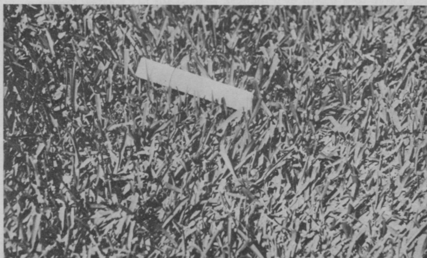
St. augustine grass tends to be coarse bladed although newer selections show finer texture.

In addition to these releases, scores of different-appearing st. augustine clones have been isolated, some dwarf, others exceptionally vigorous, in many shades of color. While some selections have looked quite promising, more testing is needed to confirm performance under a wide range of field conditions.