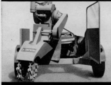
Cutter head boom maneuvers side-toside and up and down hydraulically. Cutting speed rate is controllable.