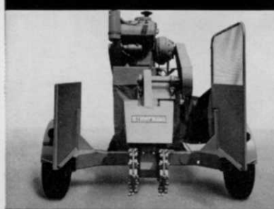
Fixed travelling wheels need no adjustment before starting the cutting operation. Back up to stump and start cutting.