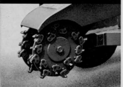
Twice the tooth life reported by owners due to special tooth holder design to give back up for tooth shank.