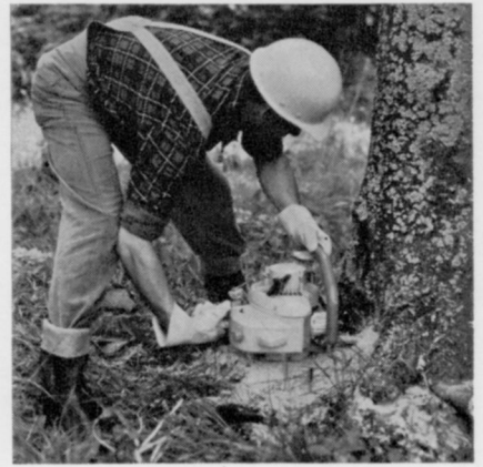
above: Solo Chain Saw 70-A 5 H.P., 7 H.P. & 9½ H.P.