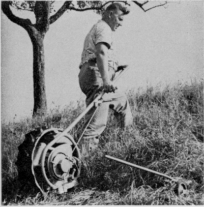
right: New Solo Junior 2½ H.P.—Only 15 lbs.