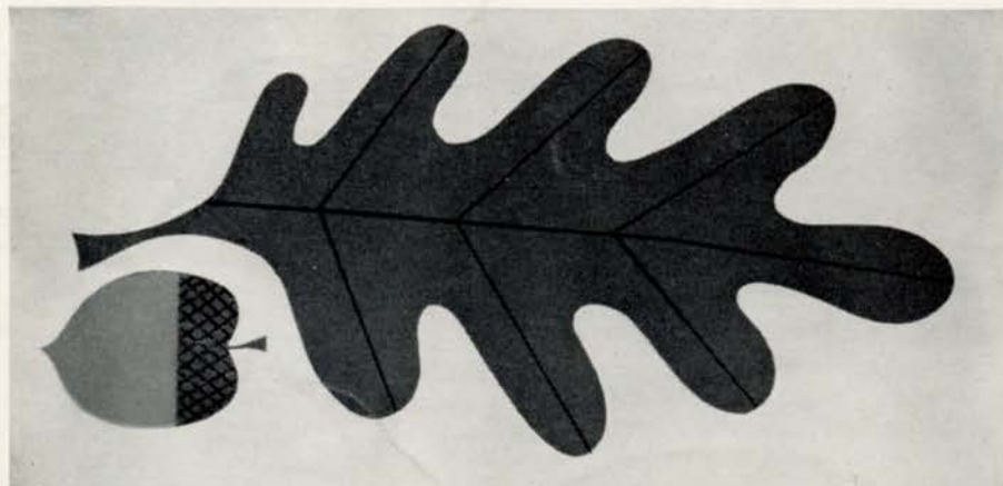
When autumn leaves fall . . . LINE RIDER formulations for dormant-cane broadcast method of killing brush.