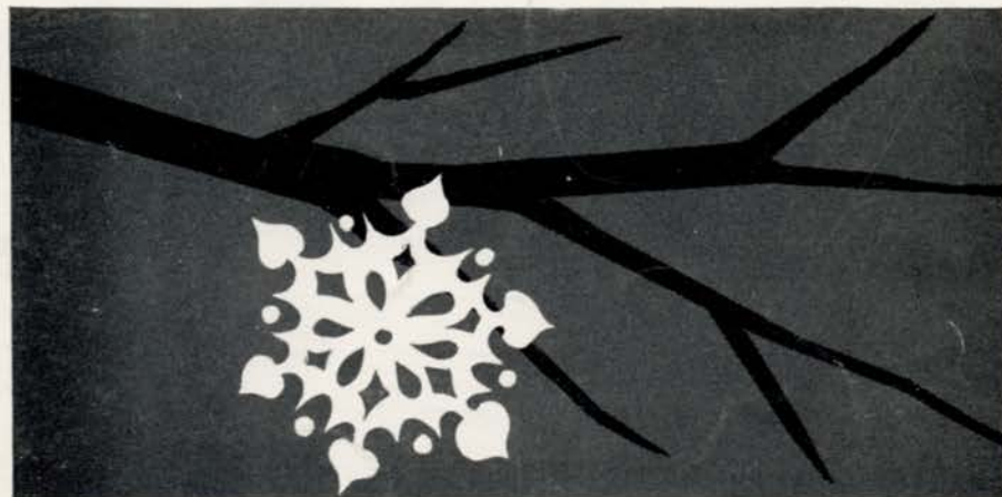
While nature sleeps . . . LINE RIDER with Pro-5 added can be used October through February.