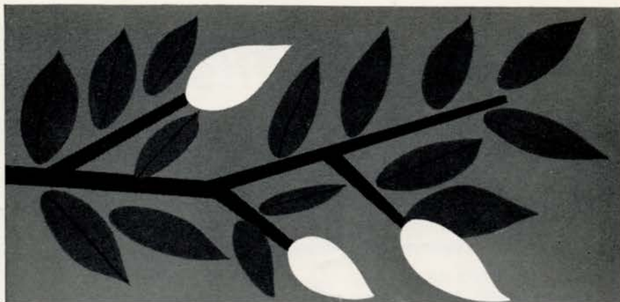
When any unwanted growth shows . . . VACATE® nonselective herbicide for dry application.