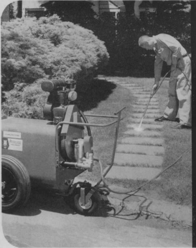
This 50-gallon Peerless is ideal for most residential jobs.