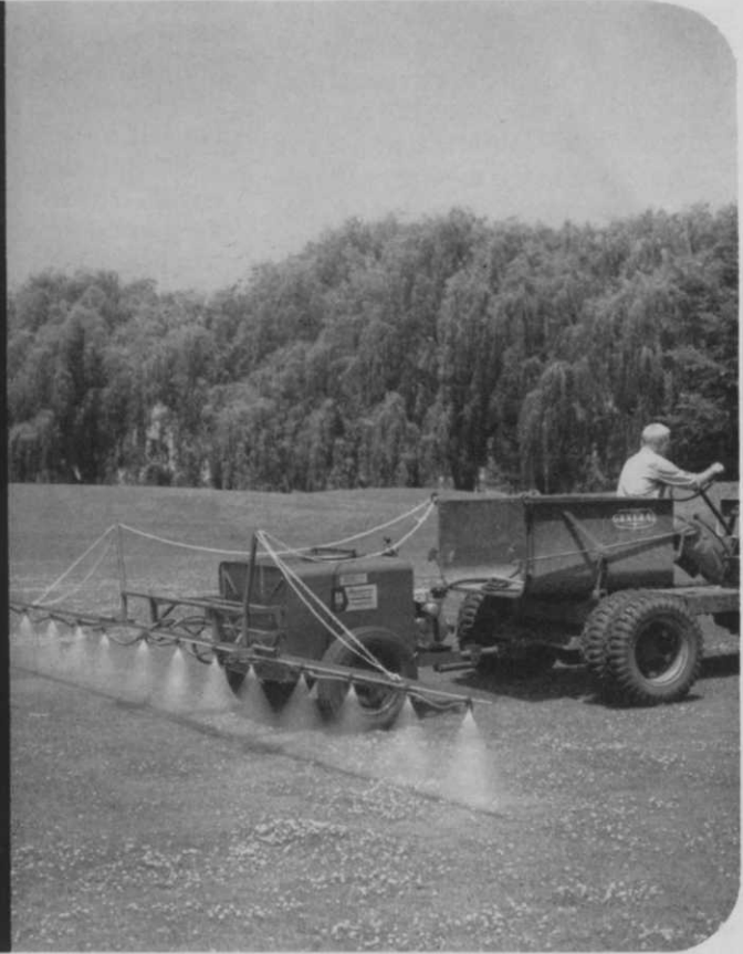
This 150-gallon Peerless with boom is for turf or roadsides.

A Peerless is ALL-PURPOSE—will handle most all contract jobs . . . from weed control and soil insect control to mosquito abatement and disinfecting . . . from homes to parks, industrial areas, golf courses, roadsides and orchards. A Peerless gives you pressure and volume to spare. Packed with power for tree and brush spraying. Sprays up to 15 acres per hour with a 30 foot boom, up to 10 acres per hour with a 20 ft.