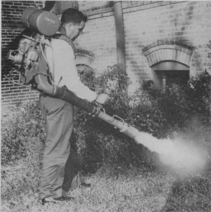
THE R.5 FONTAN FOR HEAVY DUTY WEIGHT 37 LBS.

A self-contained unit, the Fontan has jets to interchange for misting or spraying, another attachment to interchange for dusting. Designed for versatility, dependability and safety, the Fontan has metal frame and padded straps for comfortable operation.