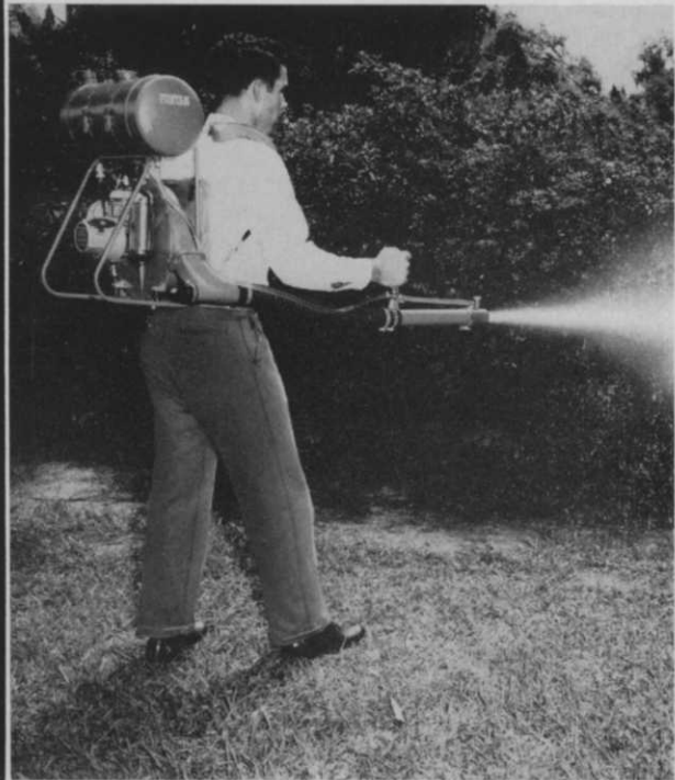
THE R.6 FONTAN FOR SMALLER JOBS WEIGHT 24 LBS.

The Fontan adjusts to allow low-volume spraying with less dilute liquid and a higher concentration of Malathion or other chemical. Both Fontans offer complete portability, choice of droplet size, easy maintenance, safe fuel injection, corrosion-resistant plated parts.