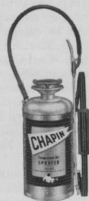
Compressed Air Sprayers