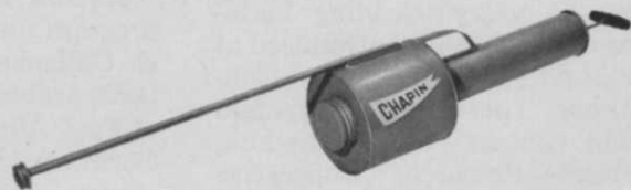
Hand Dusters and Sprayers