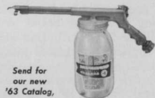
Hose end Sprayers