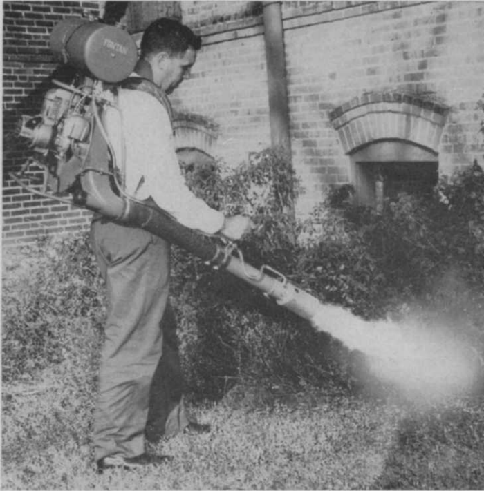
THE R.5 FONTAN FOR HEAVY DUTY WEIGHT 37 LBS.

A self-contained unit, the Fontan has jets to interchange for misting or spraying, another attachment to interchange for dusting. Designed for versatility, dependability and safety, the Fontan has metal frame and padded straps for comfortable operation.