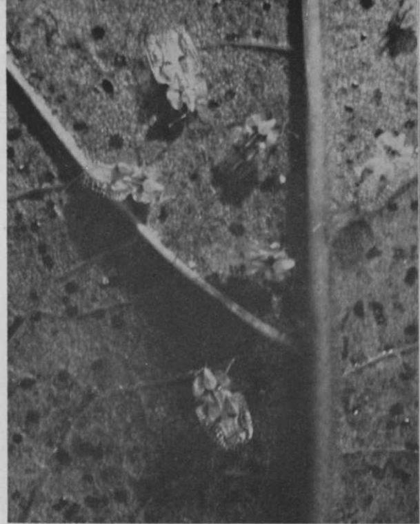
Lacebugs on this sycamore leaf have left excrement deposits, (small, round, black spots).

controlling many soil inhabiting insects. This material also is effective in controlling many of the chewing insects such as grasshoppers, tree crickets, immature and adult beetles, and caterpillars. It is a fairly toxic material and should be used with caution.