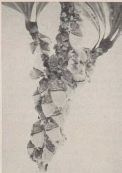
Cottony cushion scales are also known as mealybugs, attack such plants as this pittosporum.

In some species of scale insects a single female may deposit several hundred eggs. The young scale, known as a crawler, is usually broadly oval in shape, flattened,