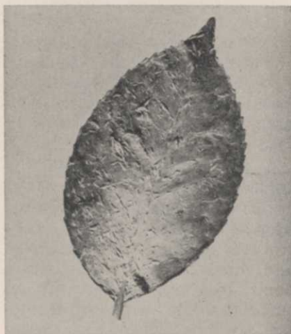
Another important pest is the "oyster shell" scale, pictured here on a camellia leaf.