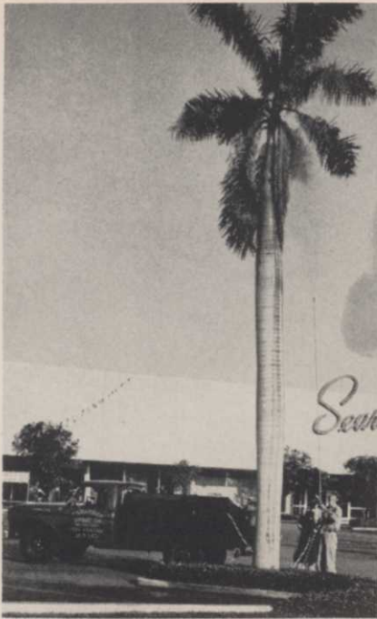
Tree spraying contracts are lucrative too, Florida sprayman Tomasello says. Once operators have the equipment and know-how, these big jobs can increase billings. Most major equipment manufacturers offer versatile high-power sprayers to enable contract applicators to diversify.

the lawns are planted to St. Augustine grass.