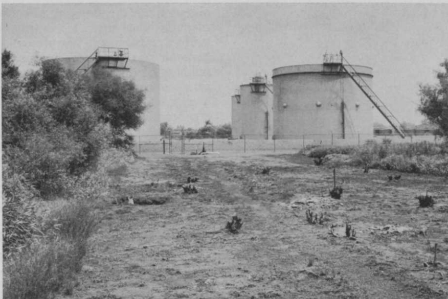
One suggested application for Chlorea herbicides is for control of weeds around tank farms and pipe lines. This installation, including the pipeline path in the foreground, was successfully treated with Chlorea, with less fire hazard and easier accessibility as direct results.

Chlorea herbicides fall within the class of chemical weed killers known variously as soil sterilants, nonselective herbicides, or total weed killers. Where applied to the soil, these total weed killers generally render it unfit for plant growth for varying lengths of time. The length of time they persist in the soil and prevent regrowth depends on the particular chemicals used and the amount lost through oxidation, leaching, and microbial breakdown. These losses