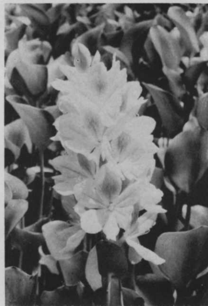
Fragile, pale, beautiful — here is the water hyacinth in bloom. This innocent looking plant now chokes hundreds of miles of southern waterways, is a scourge to navigation, and provides breeding spots for mosquitoes. Members of the Hyacinth Control Society are dedicated to the control of this flowering, prolific weed.

The amitrol formulation was more effective than any other material at equivalent rates, and