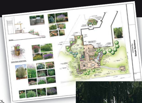
Sample projects from Cooperative Design Resource, which serves the Denver Metro area.