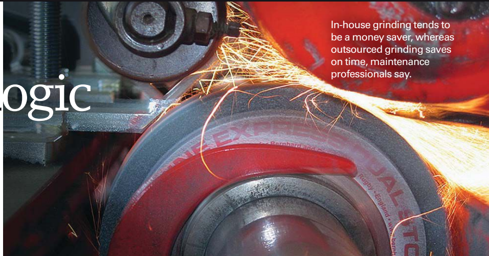
In-house grinding tends to be a money saver, whereas outsourced grinding saves on time, maintenance professionals say.