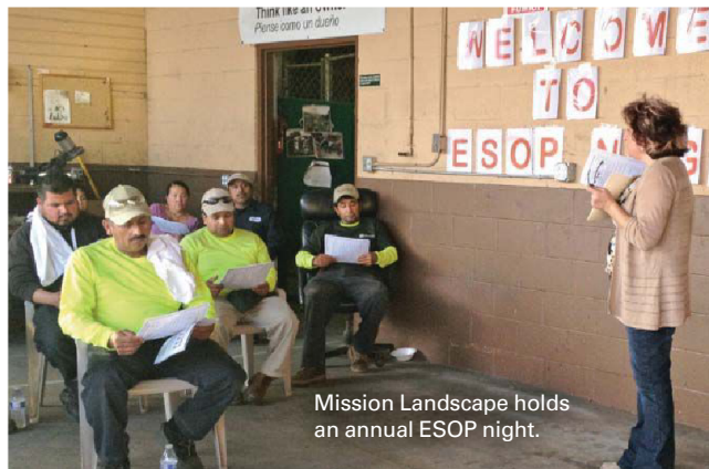
Mission Landscape holds an annual ESOP night.