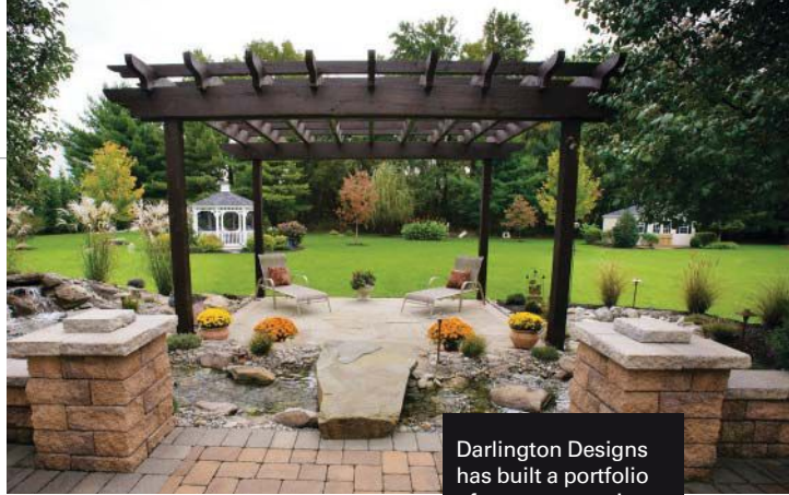
Darlington Designs has built a portfolio of carpentry projects over six years.