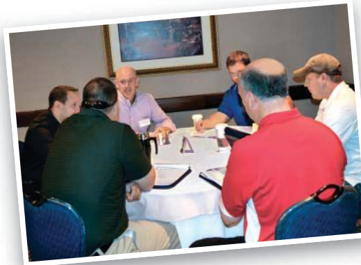
Sno-Motion attendees participated in roundtable talks.

▶ Test run. When Harwood ran a snow and ice management firm, the company would do a "fire drill" before the season's first true snowfall. When there was a dusting of snow, the company would bring all staff in, guarantee them four hours on the clock to make it worth their while and run them through all the procedures.