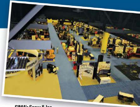
SIMA's Snow & Ice Trade Show was held in Minneapolis in June.

organization's goals and values to create buy-in. Remember, employee satisfaction equals customer loyalty. "People want to do business with employees who look like they love what they're doing," he said.