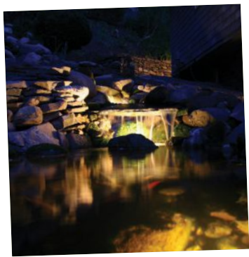
An outdoor kitchen acts as a retaining wall for a Koi pond. The stream and waterfall flow into the pond.