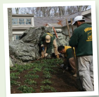
Vinca plant and natural boulder installation.