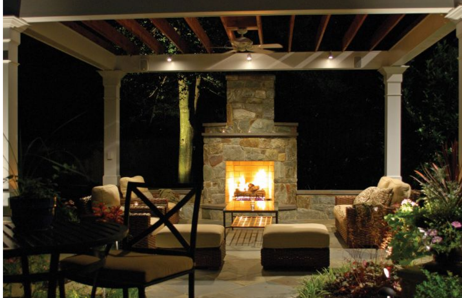
One affluent customer flew a design team to a hotel in Miami to show the company the structure he wanted his project to resemble.