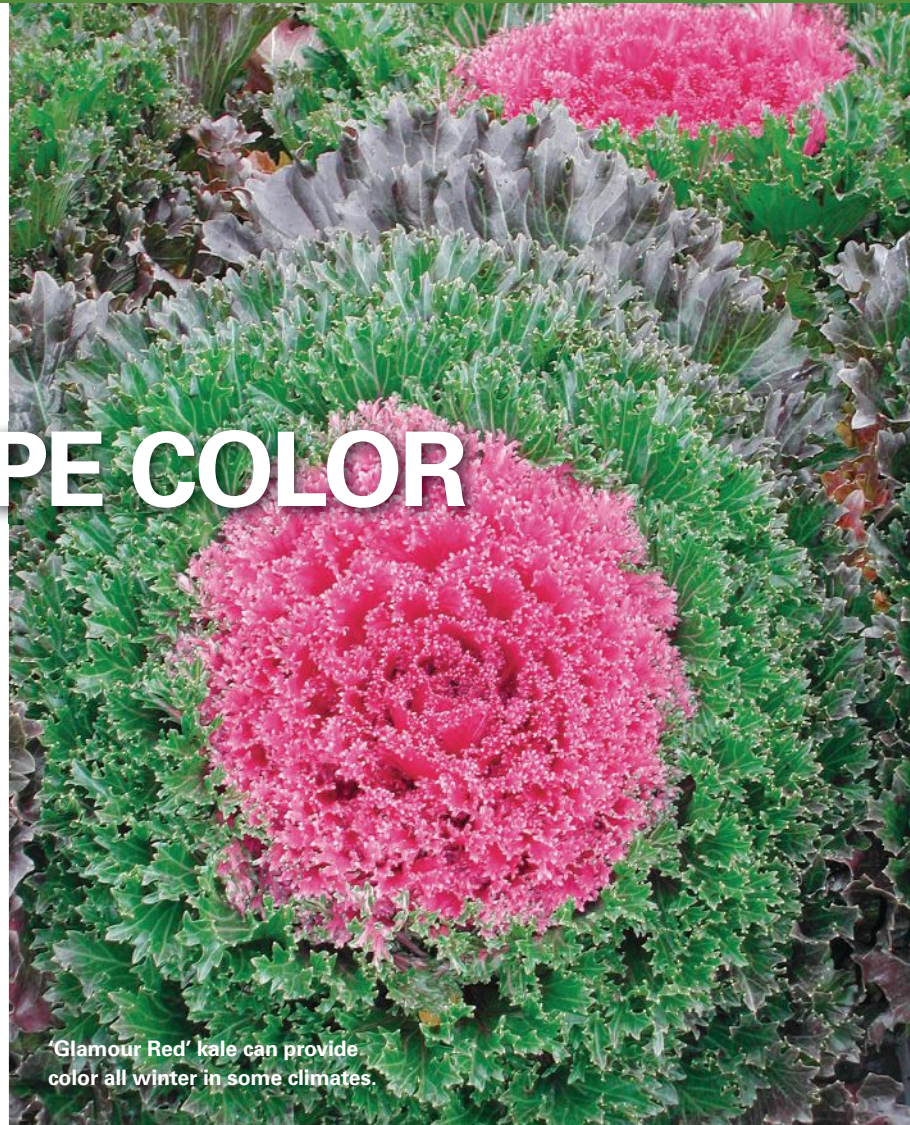
'Glamour Red' kale can provide color all winter in some climates.

There are thousands of perennials and ornamentals to choose from, but you can narrow them down by beginning with plants tested by associations and botanical gardens. One such association, the Perennial Plant Association (PPA), has chosen Amsonia hubrichtii as its