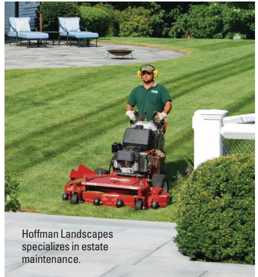
Hoffman Landscapes specializes in estate maintenance.

"I think the customers are changing. They're becoming more demanding. They want more for the same dollar. I believe you have to deliver that, because it's a competitive marketplace. If you don't, someone else will."