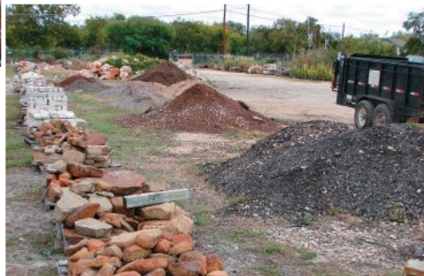
Above: Security is an important expense to consider when building a holding yard.