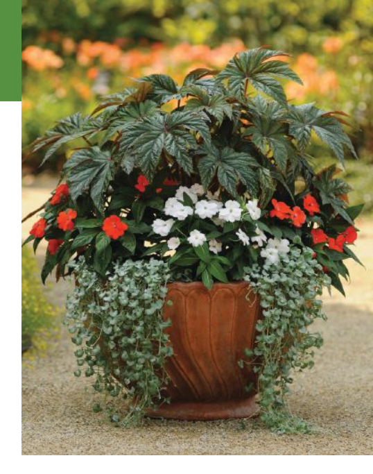
Ball's Gryphon Begonia creates a uniform mound, while the company's Silver Falls Dichondra cascades out from under Celebration Orange N.G. Impatiens and Celebrette Frost N.G. Impatiens.

The group of plants most immediately thought of for container use may be annuals. In addition to new versions of old favorites, many new choices are available. Geraniums feature new zonal, ivy, and cascading types. New petunia colors are available as well as improved trailing