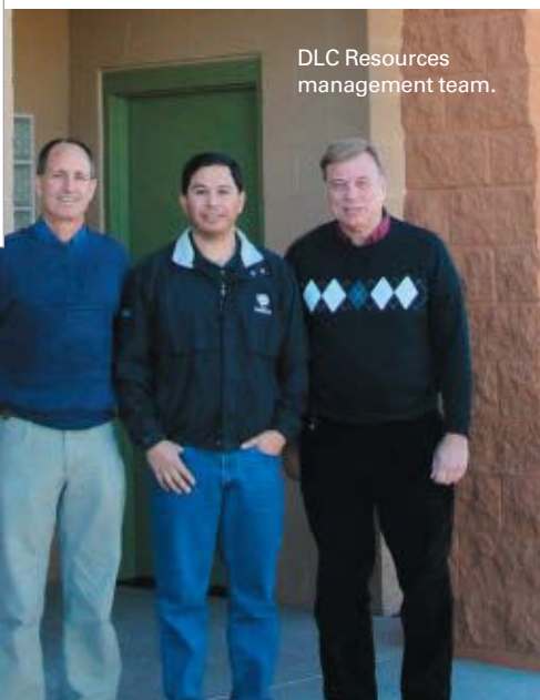
DLC Resources management team.

2010 Growth: 0% with 10% to 15% expected as a result of expansion into new markets