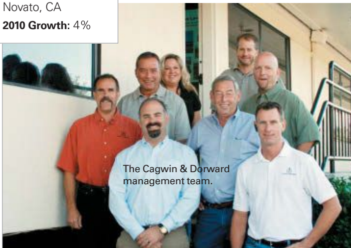
The Cagwin & Dorward management team.

Cagwin & Dorward Novato, CA 2010 Growth: 4%