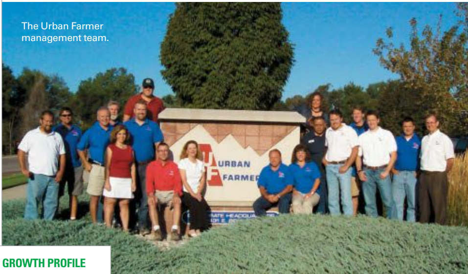
The Urban Farmer management team.