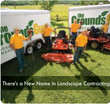
There's a New Name in Landscape Contracting