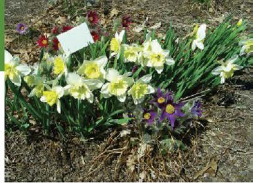
This combination shows contrasting foliage texture, simultaneous blooming, and perennial foliage cover.