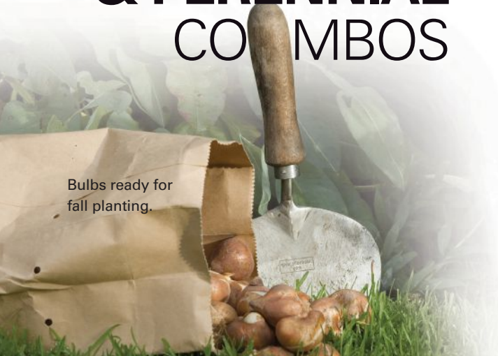
Bulbs ready for fall planting.

C ORNELL UNIVERSITY researchers have scientifically examined the art of successful bulb and perennial pairings. Professional landscape designers have long known perennials and spring-flowering bulbs such as tulips, narcissi and alliums make great companion plantings. Not only do the proper pairings look great together, they can be mutually supportive. For example, colorful spring bulbs can complement emerging perennial foliage — and when that foliage matures, it can mask the fading leaves of post-bloom bulbs.