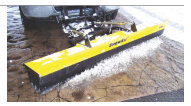
continued on page 46

Attachable to most brand-name snowplows, SnowEx's new SPB-072 and SPB-090 Snowbrooms are capable of clearing snow and slush without damaging concrete, sod or sprinkler heads. This makes them an ideal choice for use on decorative concrete, sidewalks and paths. They also add versatility to mid- and full-sized pickup trucks by allowing them to remove sand, salt and other debris after the winter season. Because the patented Snowbrooms take advantage of existing equipment, they contain no engines, pulleys, sprockets, belts, chains or any other moving parts. Trynexfactory.com