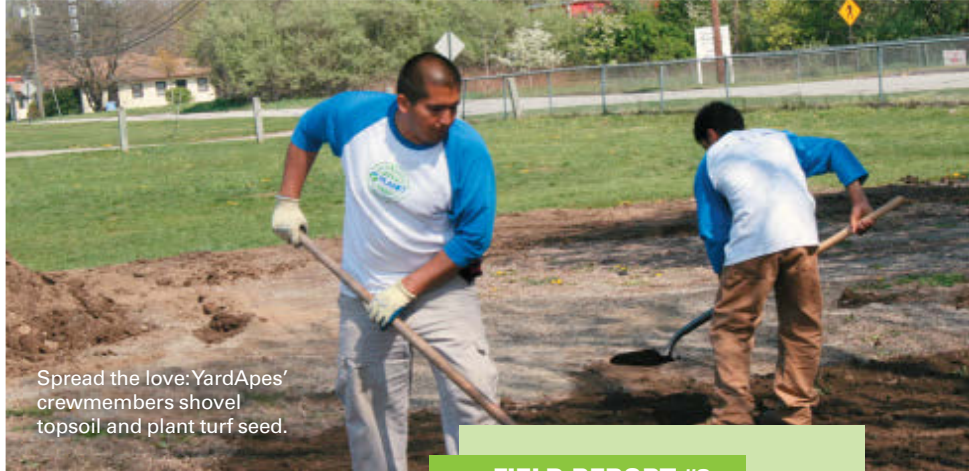
Spread the love: YardApes’ crewmembers shovel topsoil and plant turf seed.