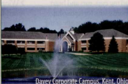
Davey Corporate Campus, Kent, Ohio

We offer proven landscape managers challenging careers and the unique opportunity to become an employee owner.