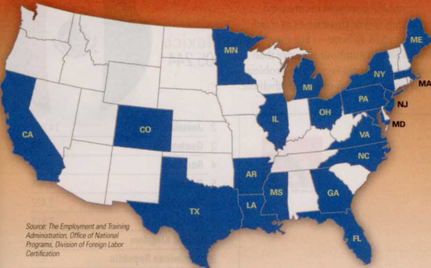
Source: The Employment and Training Administration, Office of National Programs, Division of Foreign Labor Certification

Following are 20 traditional hotbeds for H-2B guest worker visa awards: