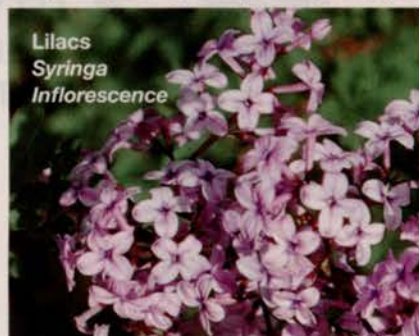
Lilacs Syringa Inflorescence

clematis. Some fragrant annuals are hyssop ( Agastache ), sweet alyssum ( Lobularia maritima ), pansies and violets (both Viola ), and stocks ( Matthiola ), and the vines, nasturtium ( Tropaeolum ), sweet pea ( Lathyrus odoratus ) and corkscrew vine ( Vigna caracalla ). Bulbs with fragrant flowers include irises, hyacinths and freesias.