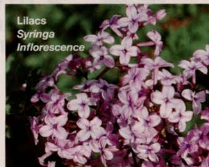
Lilacs Syringa Inflorescence

clematis. Some fragrant annuals are hyssop ( Agastache ), sweet alyssum ( Lobularia maritima ), pansies and violets (both Viola ), and stocks ( Matthiola ), and the vines, nasturtium ( Tropaeolum ), sweet pea ( Lathyrus odoratus ) and corkscrew vine ( Vigna caracalla ). Bulbs with fragrant flowers include irises, hyacinths and freesias.