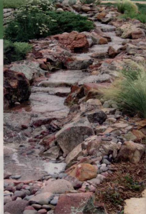
This drought-resilient landscape includes a man-made stream that will create an attractive dry streambed in times of drought.

each drop of water — and with good reason. According to the Environmental Protection Agency, more than 50 percent of water used to irrigate lawns and gardens is wasted. And that's a lot of waste because between 30 and 50 percent of the average American household's water use goes to outdoor uses.