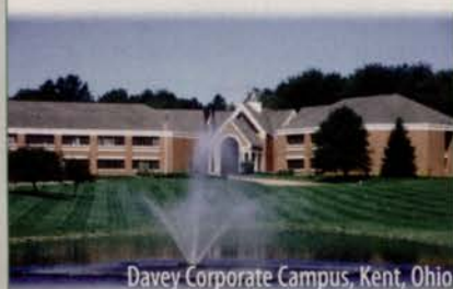
Davey Corporate Campus, Kent, Ohio

We offer proven landscape managers challenging careers and the unique opportunity to become an employee owner.