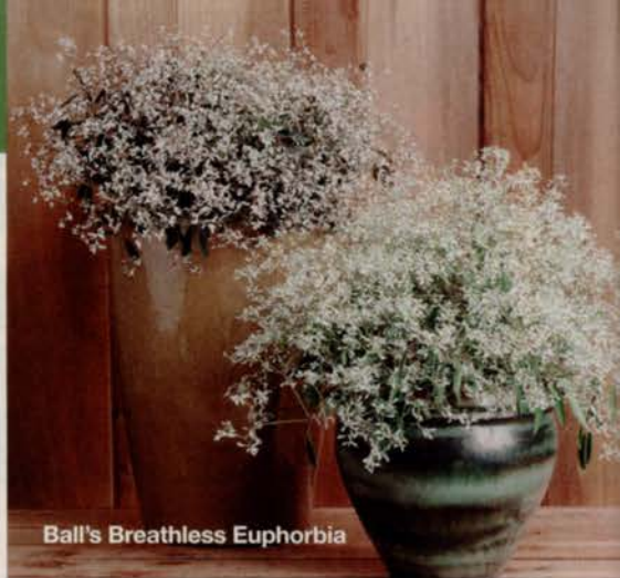
Ball's Breathless Euphorbia

With a theme of "Color 365," the Pack Trial displays at Goldsmith Seeds will show attendees how to extend the traditional