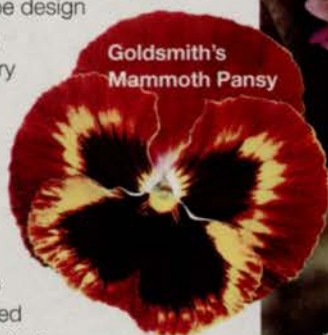
Goldsmith's Mammoth Pansy