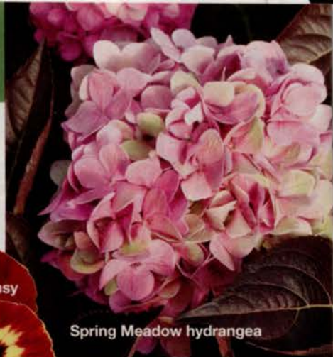
Spring Meadow hydrangea