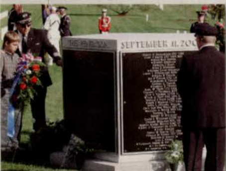
Arlington National Cemetery dedicated a five-sided memorial to the 184 victims killed when terrorists seized control of American Airlines Flight 77 and flew the plane into the Pentagon on Sept. 11, 2001.

In its second year, the annual enhancement project moved from February to July (along with the association’s annual Legislative Day), which allowed more aeration, turf renovation and sodding work and helped draw more volunteers. Not long after, Renewal & Remembrance expanded to include tree care, design/build work and weed control at Historic Congressional Cemetery in Washington, D.C., where 19 Senators and