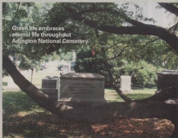
Green life embraces eternal life throughout Arlington National Cemetery.

And my spirits soared to Heaven after reading a neighboring tombstone: Love Makes Memory Eternal.