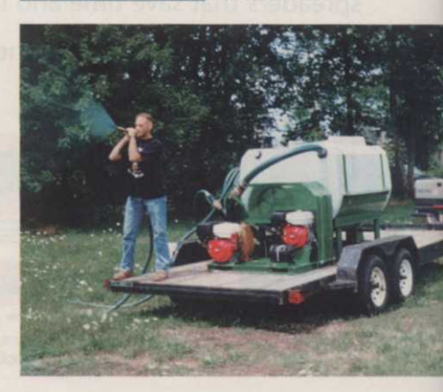
continued on page 84

For more information contact Turbo Technologies Inc. at 800/822-3437 or www.turboturf.com/circle no. 262