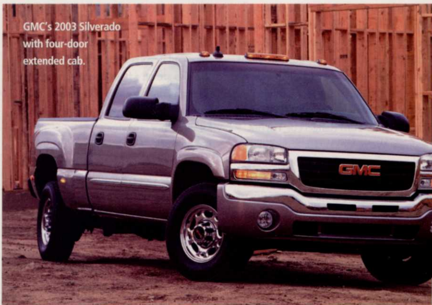
GMC's 2003 Silverado with four-door extended cab.

2003 Silverado (available in 3/4- and one-ton pickups, including 3/4-ton 2500HD and one-ton 3500 Series regular cabs, four-door extended cabs, crew cabs and chassis cabs)