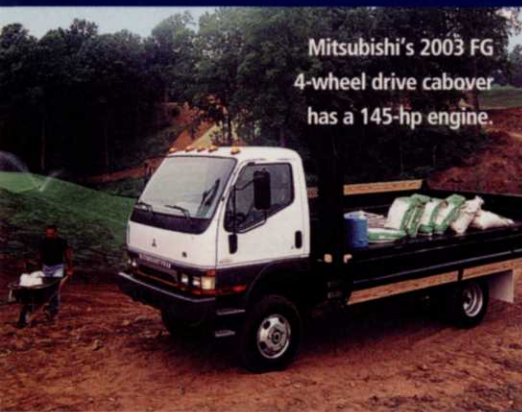
Mitsubishi's 2003 FG 4-wheel drive cabover has a 145-hp engine.