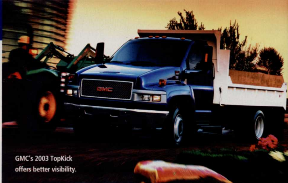
GMC's 2003 TopKick offers better visibility.