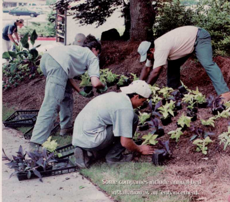
Some companies include annual bed installation as an 'enhancement.'