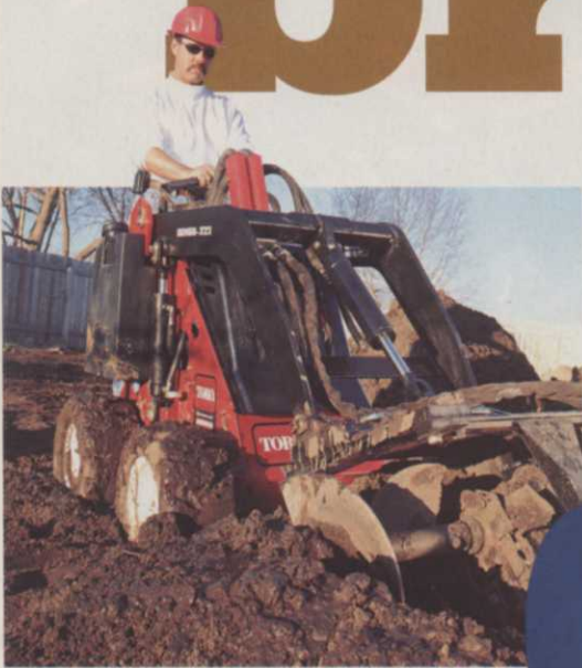
A variety of attachments allow this Toro Dingo power unit to tackle multiple landscaping tasks.

Compact skid-steer and utility track loaders give landscapers small but powerful tools to reduce labor costs