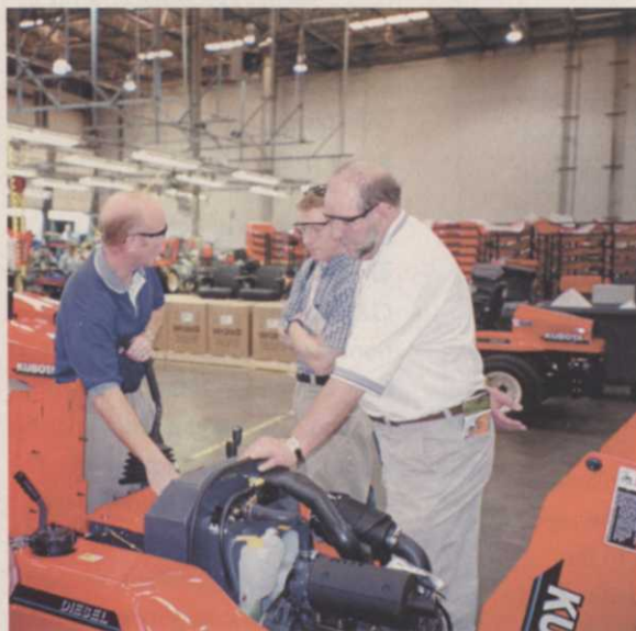
Modernization continues at mower-producing KMA plant

plant north of here in May. The KMA plant, which has undergone 10 expansions since it began operations in 1988, also builds front loaders, backhoes, lawn & garden tractors, and sub-compact tractors. Its newest entry into the sub-compact category is the BX 22, a beefed up four-wheel drive unit equipped with a six-ft. backhoe and front loader.